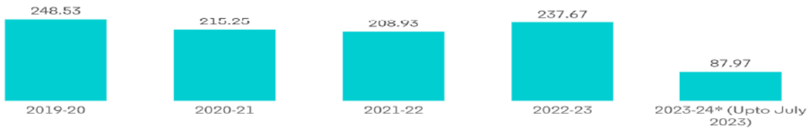
India Coal Market: Total Coal Import, in million tonnes, India, 2019-20 - 2023-24 (July 2023)

Hence, owing to the above points, increasing thermal-based power generation projects are expected to drive the Indian Coal Market during the forecast period.